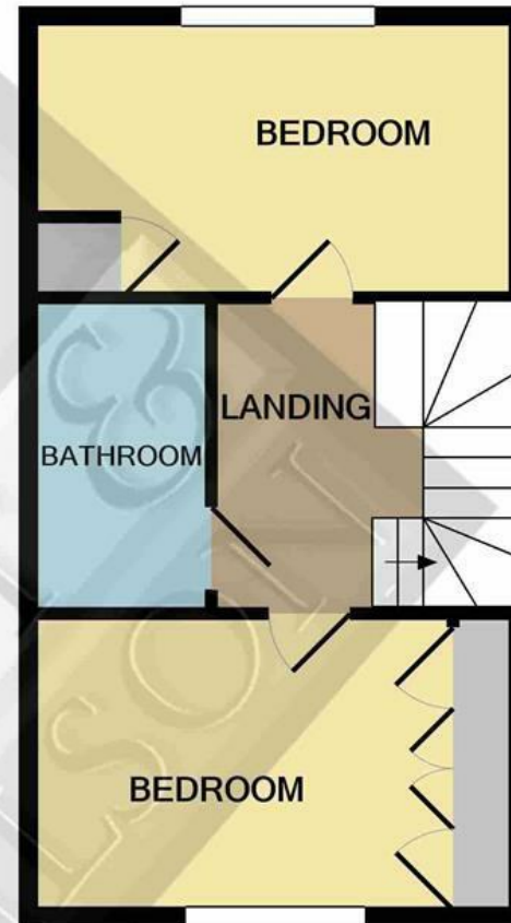
1ST FLOOR APPROX. FLOOR AREA 279 SQ.FT. (25.9 SQ.M.)

TOTAL APPROX. FLOOR AREA 583 SQ.FT. (54.2 SQ.M.)